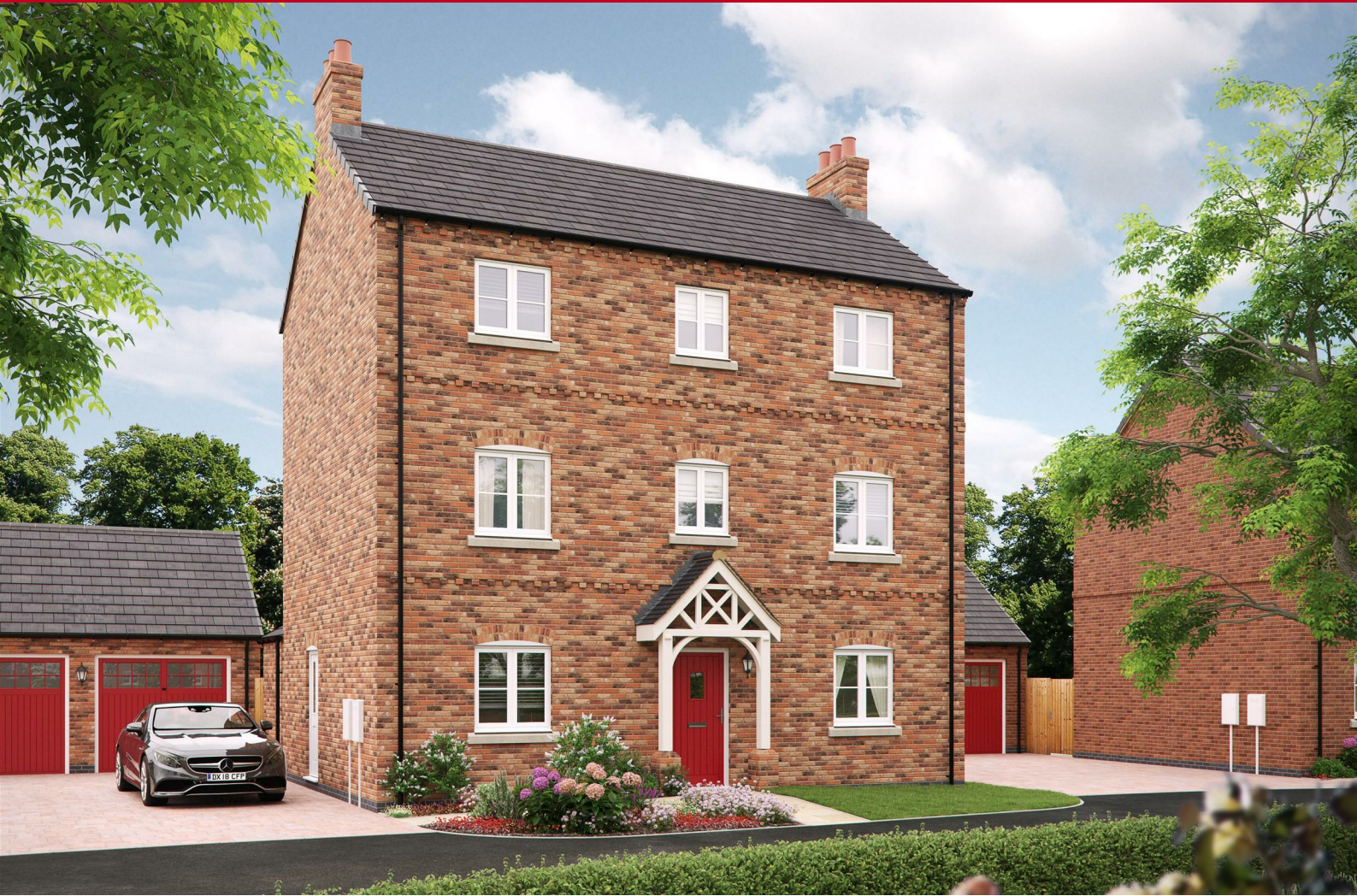
Field Farm Ilkeston Road, Stapleford, Nottinghamshire